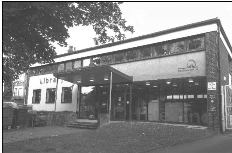
Hale End Library - facing destruction!

Local residents have been shocked to learn that the Council is planning to demolish Hale End library to use for housing. The Council wants to make the library smaller by moving it to rented units from Tesco's.