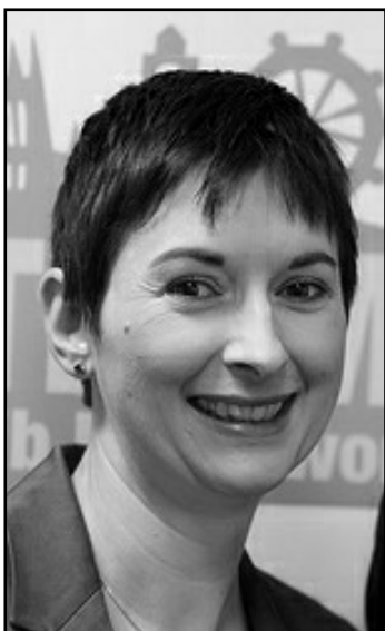
Lib Dem Mayoral candidate Caroline Pidgeon

Caroline Pidgeon, the Liberal Democrat candidate for Mayor of London , set out plans for half price fares on Underground, DLR, Overground and TfL Rail services for people who start their journeys before 7.30am.